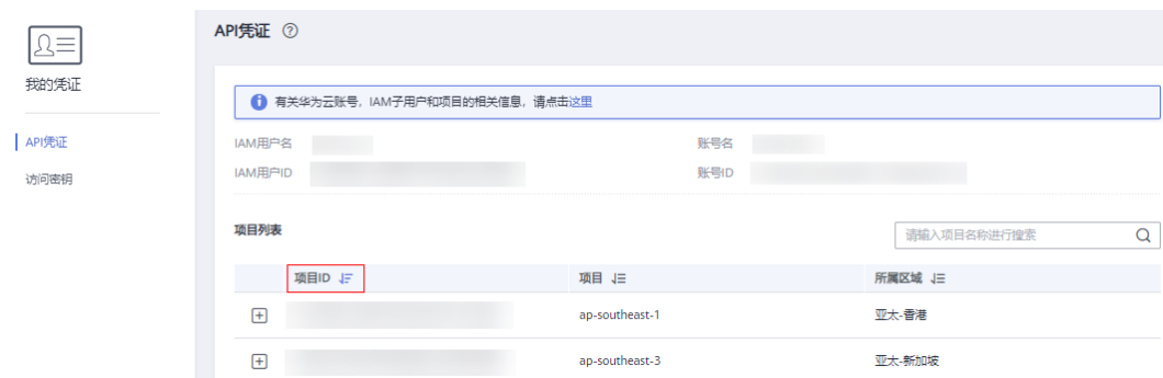
图 6-1 查看项目 ID