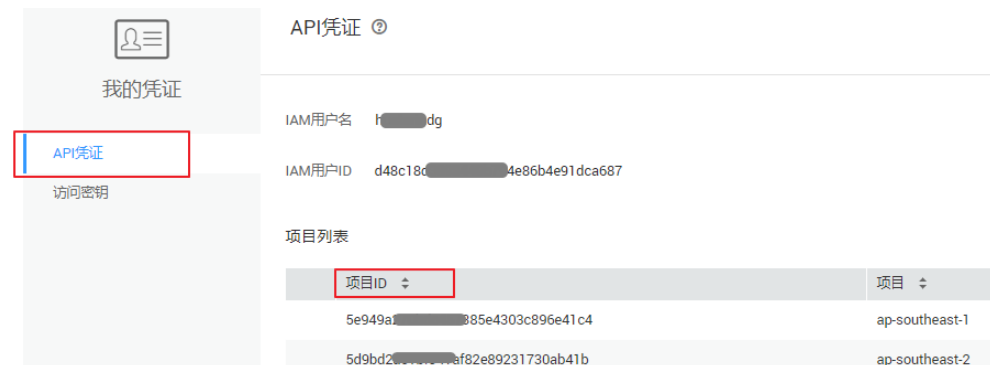
图 8-1 查看项目 ID