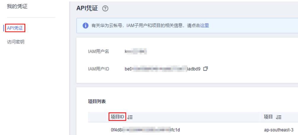
图 5-1 查看项目 ID