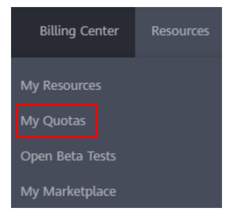
Figure 5-1 My Quotas

4. View the used and total quota of each type of resources on the displayed page.