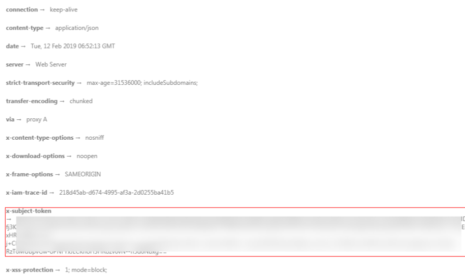
Figure 3-1 Header fields of the response to the request for obtaining a user token

For security purposes, you are advised to set the token in ciphertext in configuration files or environment variables and decrypt it when using it.