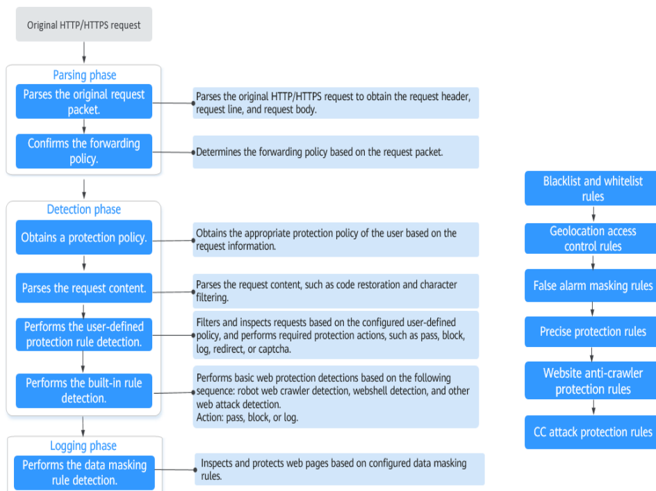
Figure 1-1 EdgeSec engine detection process

For details about the EdgeSec protection process, see Configuration Guidance .