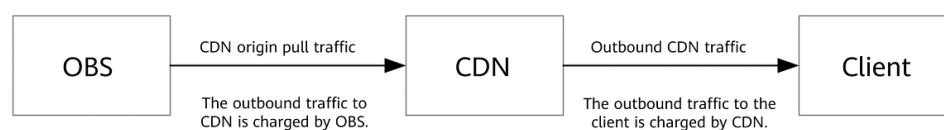
Figure 3-1 Outbound traffic

If OBS is used as an origin server, the traffic consumed by CDN to request resources from OBS is origin pull traffic, which is billed by OBS. See Figure 3-1 .