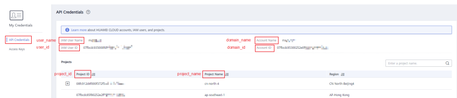
Figure 6-2 Viewing the account, user, and project information