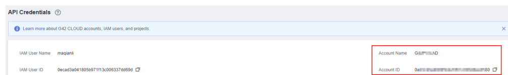
Figure 7-1 Viewing the domain name and domain ID