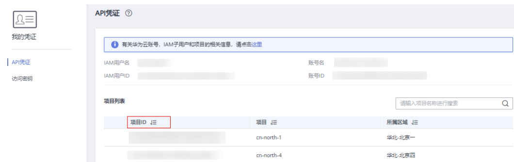
图 6-1 查看项目 ID