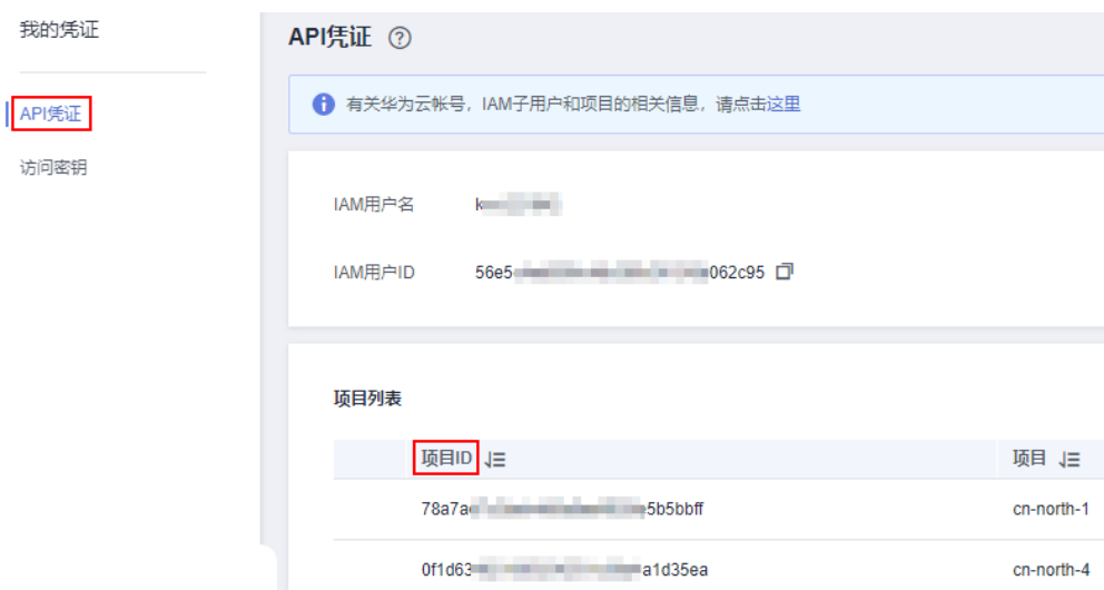
图 6-1 查看项目 ID