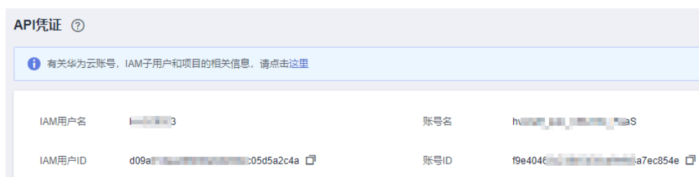
图 8-2 查看账号名和账号 ID