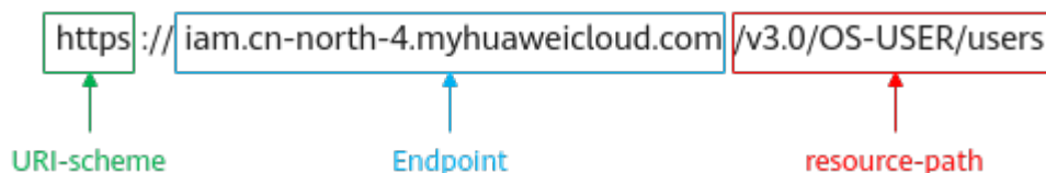
图 3-1 URI 示意图

https://iam.cn-north-4.myhuaweicloud.com/v3.0/OS-USER/users