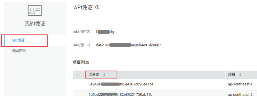
图 8-1 查看项目 ID