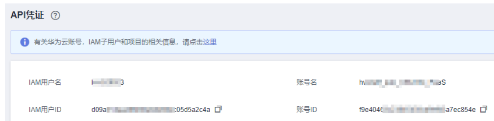
图 9-2 查看账号名和账号 ID