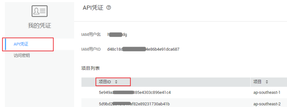
图 9-1 查看项目 ID