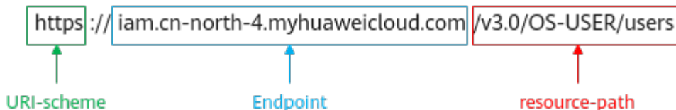
图 3-1 URI 示意图

https://iam.cn-north-4.myhuaweicloud.com/v3.0/OS-USER/users