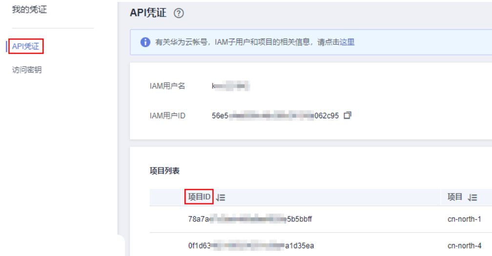
图 5-1 查看项目 ID